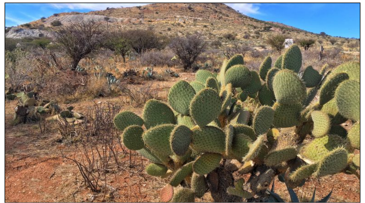
A western view of Southern Silver Exploration's polymetallic Cerro Las Minitas project in Durango state, Mexico.